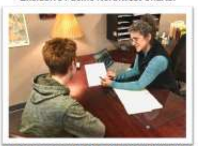
In house credentialing included with tuition!