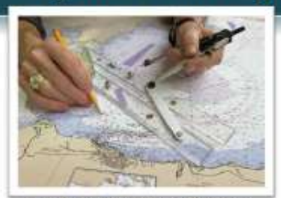
Exclusive Pacific Northwest Charts!

Experience the Flagship Difference for yourself - enroll today!