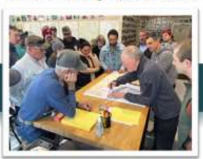
In-person, hands-on, classroom training!